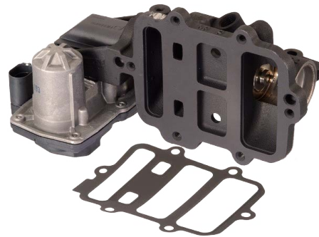
EGR valve with gasket (item no. 7.04999.34.0)

The newly installed EGR valve is not the cause of the whistling.