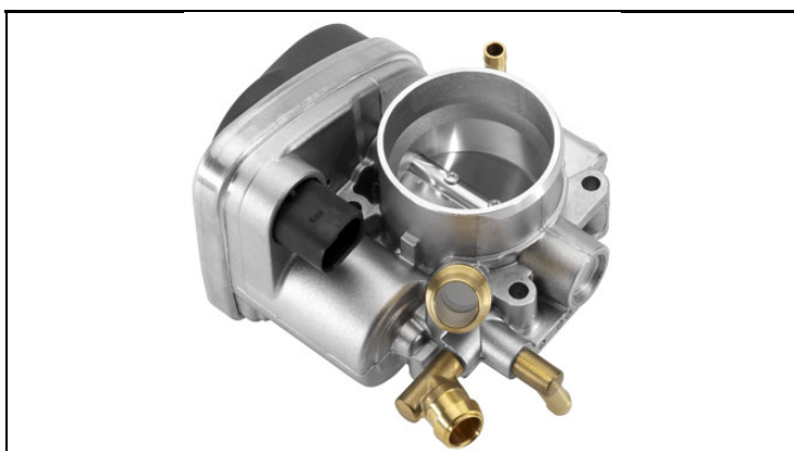
1 - Produkt / Product