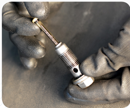
Removing the pre-filter from the oil feed line coupling

NB! When installing the new turbo from Nissens, always comply with the installation instructions included in the product box. Disregarding any of the above instructions may lead to serious, irreversible failures of the newly installed turbocharger and/or of the engine.