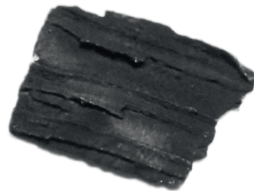
Possible cause of damage: Broken pieces of the catalytic converter