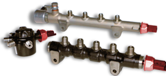
Fuel pressure sensors on the rail (highlighted in red)