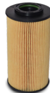
Eco / Cartridge