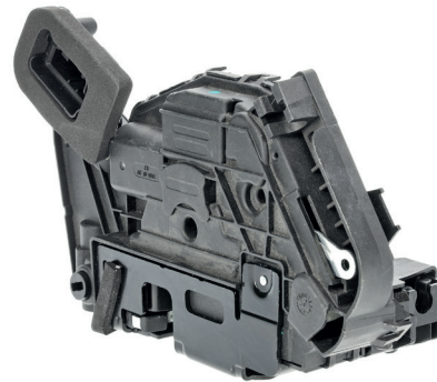
Door lock for VW / Audi AIC item no.: 58331 OE ref. No.: 5TA 839 015D

A first sign is often the delayed reaction of the lock after opening or closing several times, as well as the automatic closing of the door without having previously operated the remote control or manually locked the door. In these situations, most vehicle owners often tend to do nothing until it leads to a complete failure of the lock. This not only puts yourself at risk, but also your passengers, if, for example, the door suddenly opens on its own during the ride.