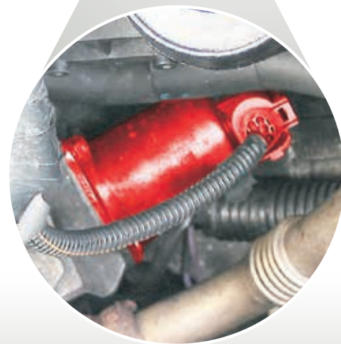
EGR valve in the Renault Master JD1M (highlighted)