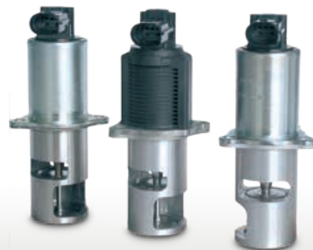
Product view (extract)

The right of changes and deviating pictures is reserved. For assignment and replacement parts, refer to the current catalogues, TecDoc CD or respective systems based on TecDoc.