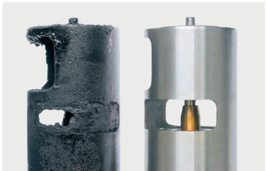
EGR valve with sticky deposits and EGR valve as new

For diagnosis information and possible causes → following pages