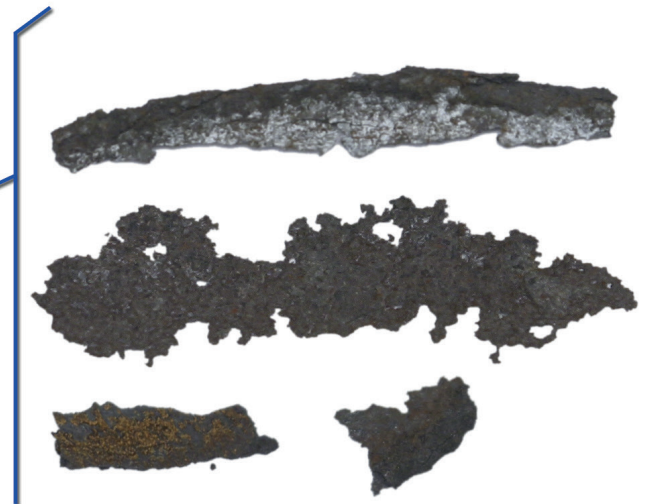
Magnified rust pieces